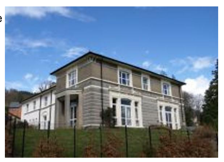
Map and additional info on the next page